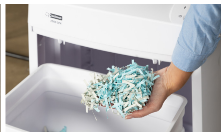
4,3x33 mm particles with security level P-4 according to DIN 66399 (ISO/IEC 21964).