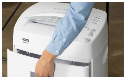
Removable 32-litre collection bin for easy disposal.