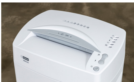
Intuitive operation thanks to clear push buttons and LED display.