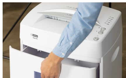
Removable 42-litre collection bin for easy disposal.