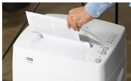
Shreds documents with paper clips and staples.