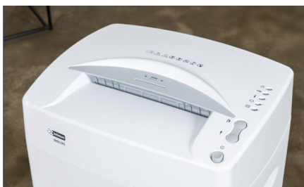
Intuitive operation thanks to clear push buttons and LED display.