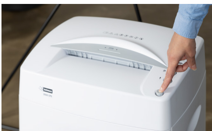
Automatic start/stop function and anti-paper jam technology.