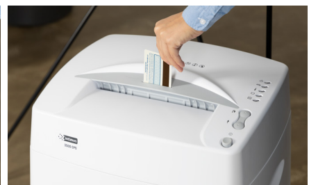
Credit cards can also be shredded via a separate feed slot.