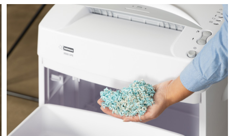
2x10 mm particles with security level P-5 according to DIN 66399 (ISO/IEC 21964).